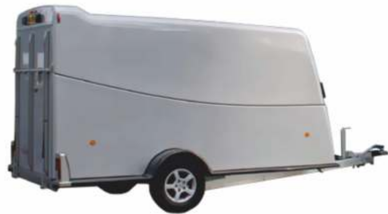
Rebel 3 E(single) Special