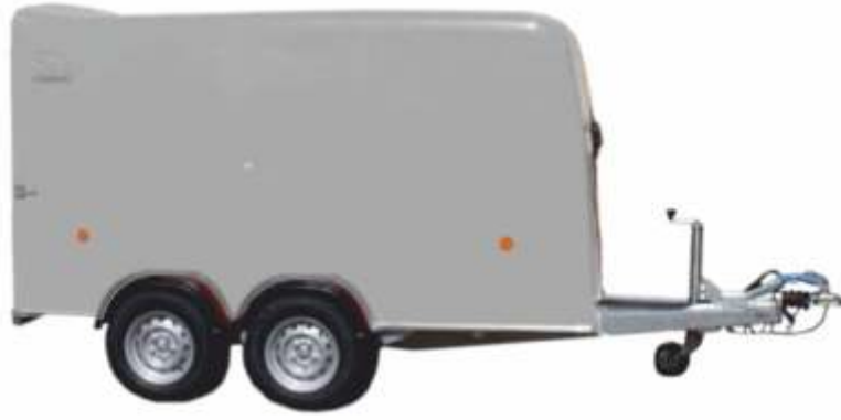
Rebel 2 Economic