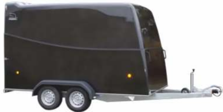
Rebel 4 Economic