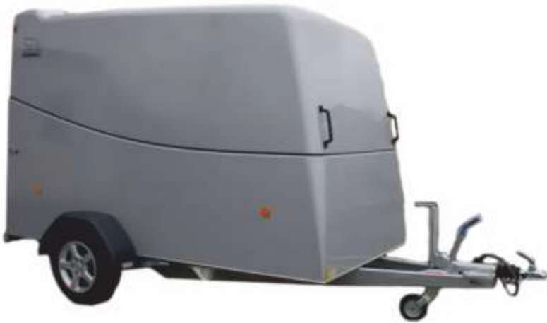
Rebel 3 E(single) Economic