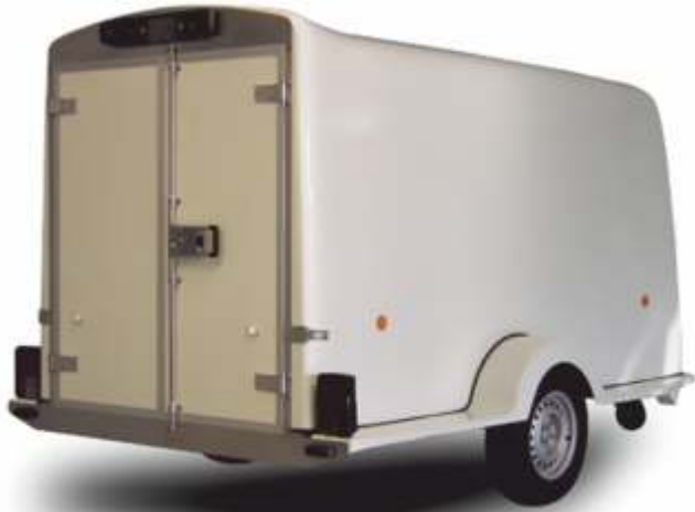
Rebel 1 Special