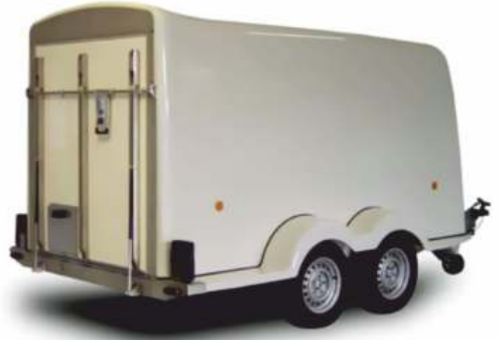
Rebel 2 Special