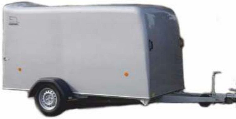
Rebel 1 Economic