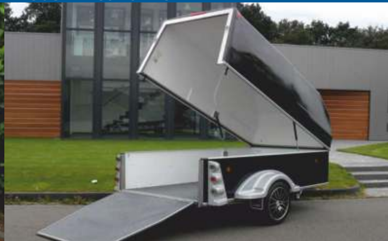
Rebel 1 Economic Toplift