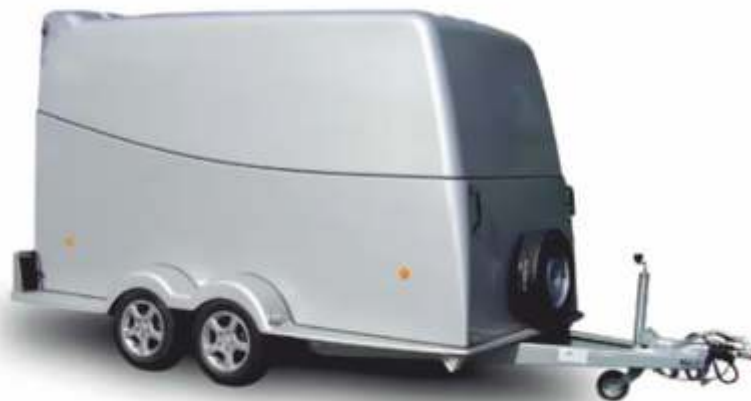
Rebel 4 Special